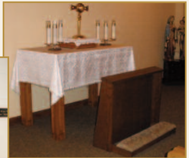
Items from the new Prayer Chapel